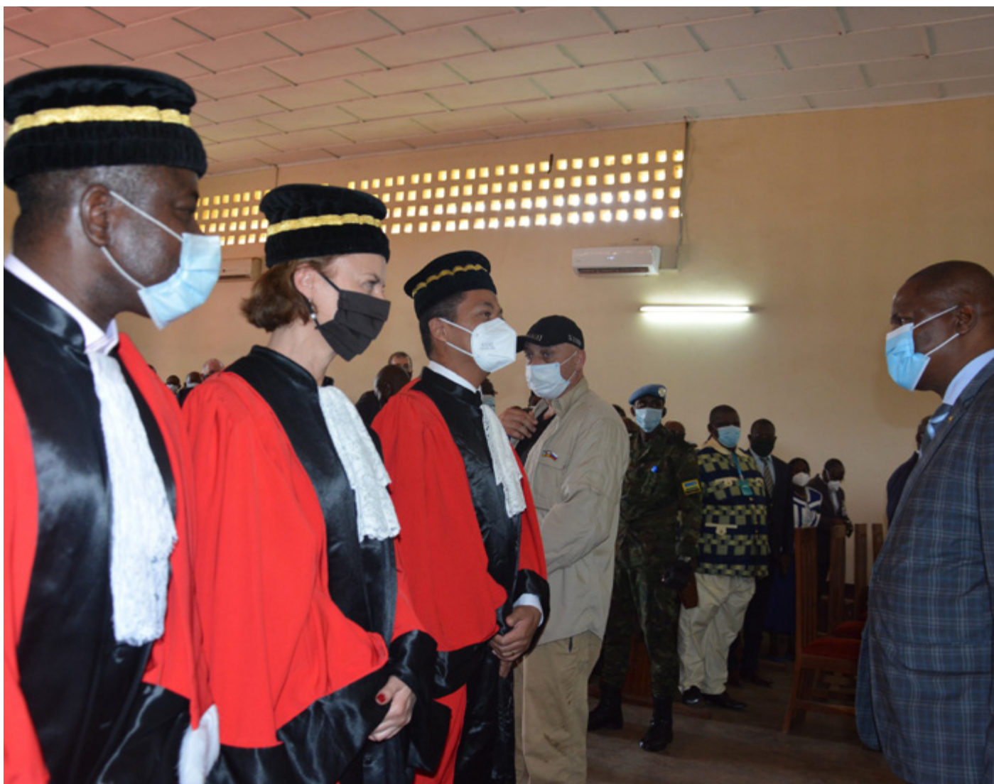
New international judges of the Special Criminal Court pledging their oath in presence of the President of the Central African Republic.