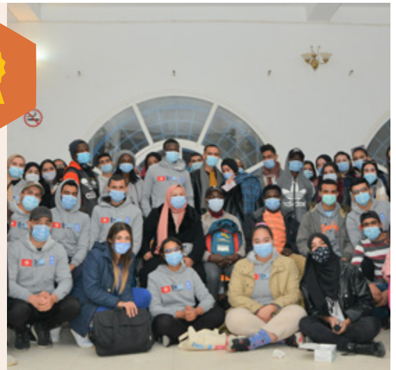
Training on Business and Human Rights for university students in Djerba, Tunisia.

Tunisia: UNDP facilitated a participatory dialogue among national institutions and private actors, trade unions, associations and academia on the respect of human rights in the fisheries value chain in the governorate of Médenine. Policy-level improvements, as well as concrete actions to improve working conditions were suggested and 23 women clam collectors, 40 fishers, 20 representatives of civil society organizations as well as 130 students were sensitized on UNGPs.