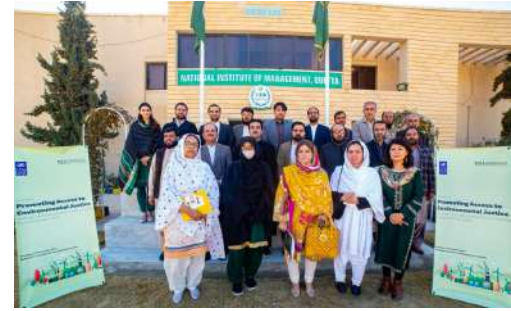
Consultation session on promoting access to environmental justice with key government departments in Balochistan.