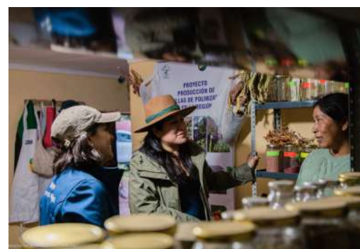
In 2023, with support from the Government of Japan UNDP's B+HR Academy trained more than 1,300 companies in human rights due diligence to enhance efforts to address human rights risks in their operations and supply chains. UNDP