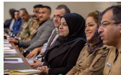
A workshop on people-centred policing at the Iraqi Ministry of Interior, Commanders' Training Center.