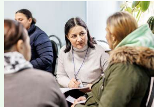
Ungheni mobile team assists Ukrainian refugees and survivors of violence directly in their communities in Moldova.