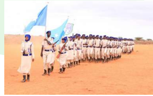
Basic recruits to the newly formed Galmudug Police Force.