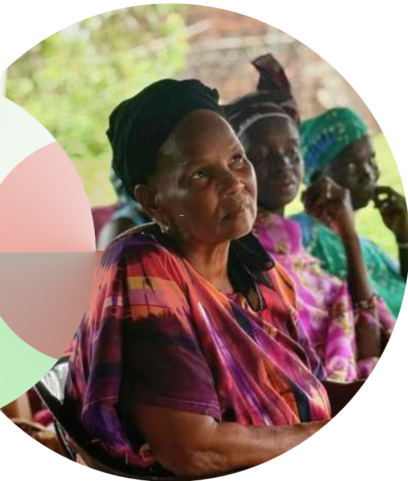
Awareness-raising session on sexual and gender-based violence in a rural area, Gabu region, Guinea-Bissau. UNDP

Across the UN system and beyond, the Global Programme serves as a unique platform for partnerships, in line with UNDP's designated 'integrator' role and in support of the One-UN approach.