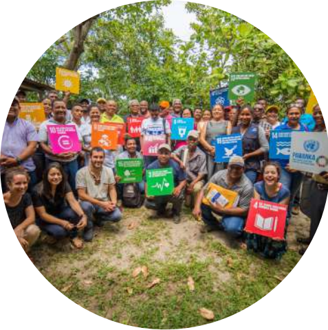
Achieving the SDGs requires building on and strengthening a culture and system of human rights promotion and protection. UNDP Honduras

In 2023, UNDP's Global Programme supported human rights institutions, systems and stakeholders in 34 countries, including through the Tripartite Partnership (TPP) among the Global Alliance of National Human Rights Institutions, UNDP and the UN Human Rights Office.