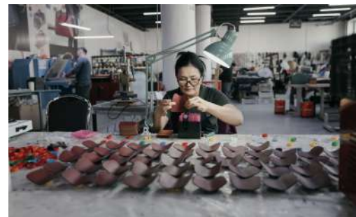
Through individual guidance sessions under the B+HR Academy, UNDP supported a local Mongolian leather production company in managing human rights risks. UNDP