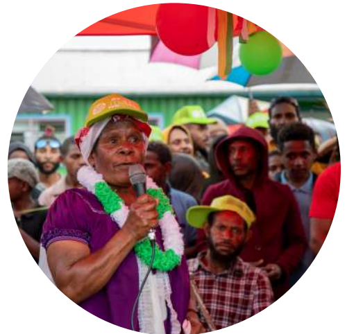
In 2023, UNDP opened a Peace Education Room in a local school in Kupari, Hela Province in Papua New Guinea. The province has been a hotspot for intercommunal conflicts in recent years.

To set the stage for SALIENT implementation in 2024, the team held consultations in Ghana, Kyrgyzstan, Panama and Papua New Guinea to identify the needs of these countries on armed violence reduction.