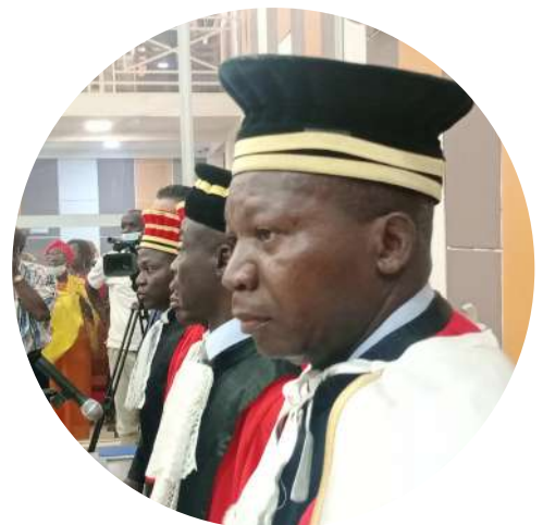
In the Central African Republic, fighting impunity is the priority of the Joint Rule of Law Programme.

In 2023, the GFP delivered catalytic funding and/or technical expertise for the joint rule of law programming in the Central African Republic, the Democratic Republic of the Congo, Haiti, Libya, Mali and Somalia. To support gender responsive rule of law and security services, GFP operationalized its working group on gender justice. It also supported a Gender Parity Initiative to ensure the deployment of women corrections officers to UN peace operations.