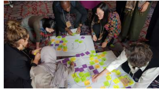
The Rule of Law, Security and Human Rights Knowledge and Learning Collaborative 2023: enabling change through MEL, innovation and integration. UNDP

In 2023, the MEL unit (co-)designed and facilitated learning events to stimulate collective reflection, exchange of knowledge and learning.