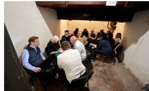
Interview with the management of the Secretariat of the Ukrainian Parliament Commissioner for Human Rights in Kyiv in the shelter during the air alert.